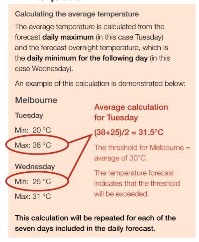
Figure 2: Example calculation of the daily average temperature

When forecast average temperatures are predicted to reach or exceed the heat health temperature threshold for a specific weather forecast district, the department will issue a heat health alert for that district